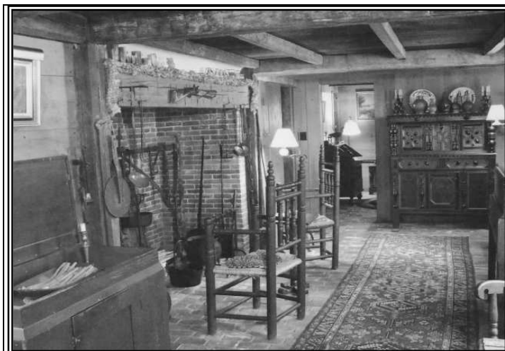
The Ell - Kitchen